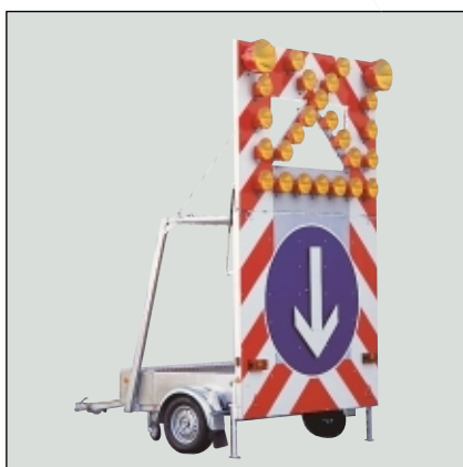
AT 93 KL (small cargo bed)