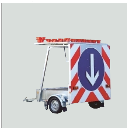
AT 93 GL (large cargo bed)

25922LPDP 1 incl. halogen flashing arrow board incl. remote hand set and turning device for mechanical arrow. GVWR: 1,000 kg