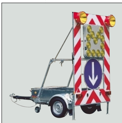
FA 2 KL (small cargo bed)